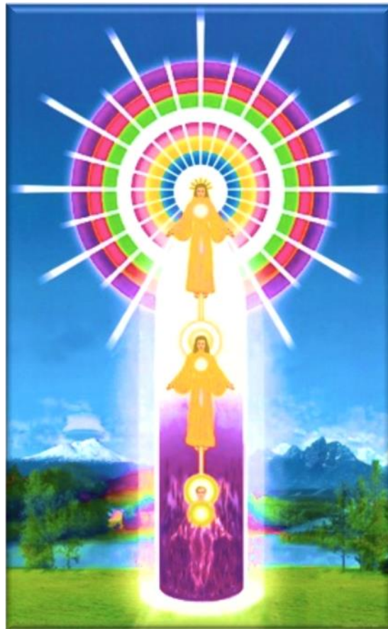
CHART OF THE 'MIGHTY "I AM" PRESENCE' COURTESY "ASCENDED MASTER TEACHING FOUNDATION" MOUNT SHASTA CA, USA

For a description of the chart, and more of The Ascended Master Teachings please go to www.iamfree.co.za