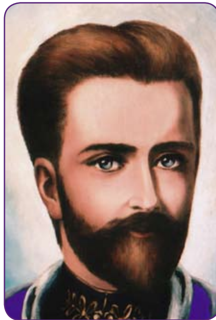
The Master Saint Germain.

It would be more difficult for a blind man